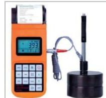
Portable Hardness Tester