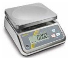
IP protected bench scale