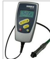
Coating Thickness Gauge